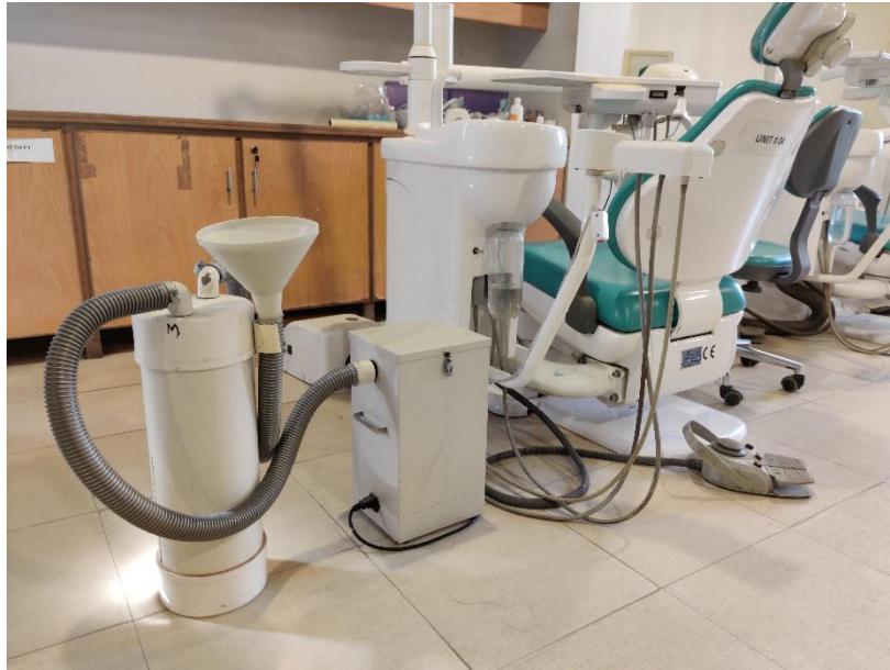
Figure 1: High vacuum extra oral dental suction system (HVEDS)

The flexible pipe allows it to be easily manipulated by the assistant and place it at the desired position, demonstrated in Figure 2.