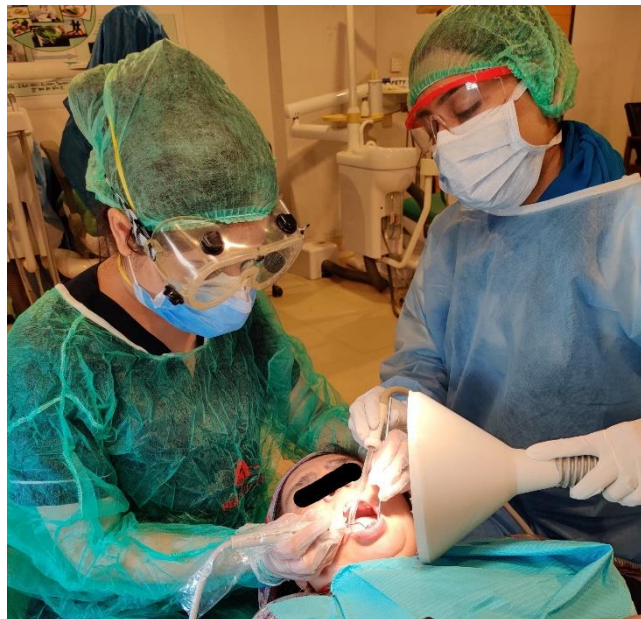
Figure 2: HVEDS in function

The flexible pipe allows it to be easily manipulated by the assistant and place it at the desired position, demonstrated in Figure 2.