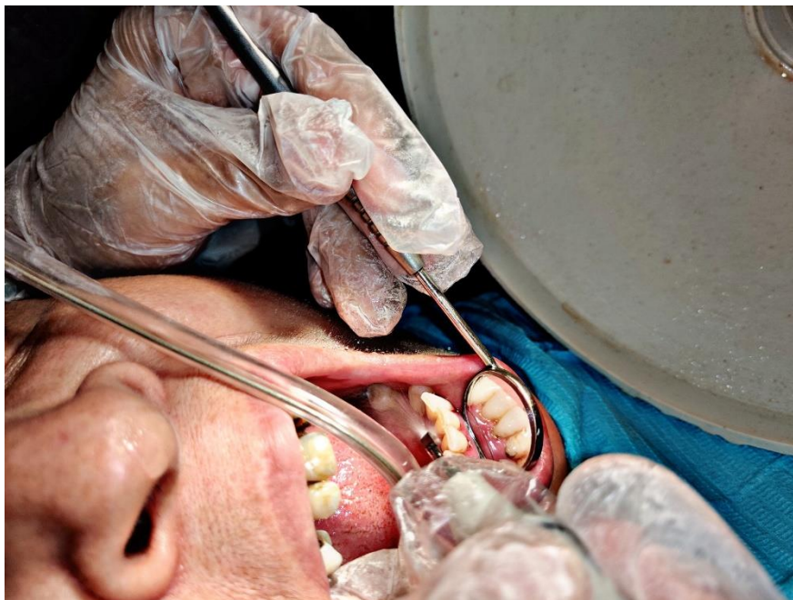
Figure 4: Aerosols getting accumulated in the aspirator

In this study, we incorporated visual droplet detection method, particularly suitable for spatter and aerosol to identify efficacy of the equipment. When tried in use, the aerosol and spatter was eliminated through the cone-shaped oil key and collected into the collection bin, shown in Figure 4.